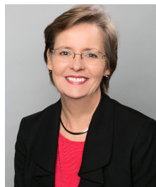
CRYSTAL T. BROUGHAN INTELLECTUAL PROPERTY BLOG