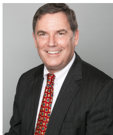
EDWARD L. BIRK MEDIA LAW BLOG