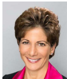
GISSELLE CARSON IMMIGRATION BLOG