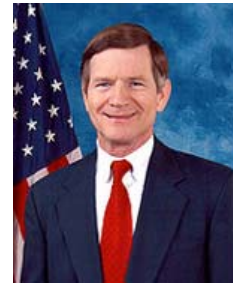
Rep. Lamar Smith

In follow-up to an issue I addressed in June on my blog ( gisellecarson.wordpress.com ), on September 21, 2011, Rep. Lamar Smith's (R-TX) "Legal Workforce Act" passed the house judiciary committee and has a strong chance of winning passage through the House. The Act would require all employers to utilize E-Verify, and would do away with the paper I-9 system with a gradual phase in process. To read more, click here